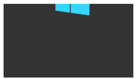
How to Start Windows 10 in Safe Mode