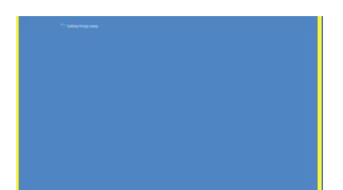
How to Factory Reset Windows 10 June 23, 2020 In "WINDOWS10"